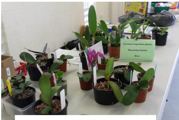
Some of the growing competition plants lining up to be measured on Sunday.