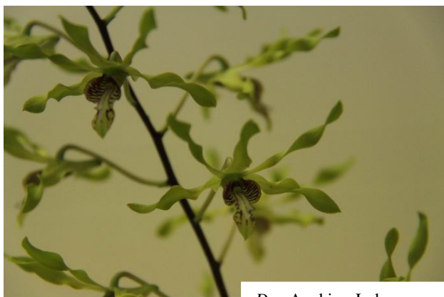
Den Anching Lubag x cochlorides x Den. canaliculatum