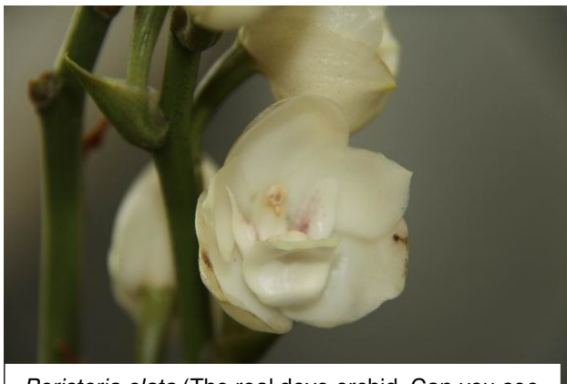
Peristeria elata (The real dove orchid. Can you see the beautiful little dove in the centre?)