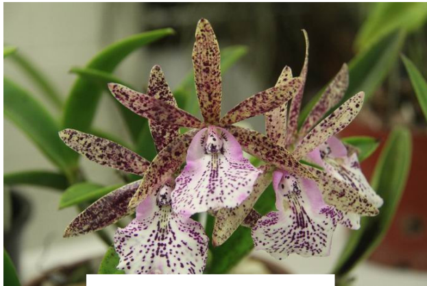
Bc. Hippodamia 'Hanabu'