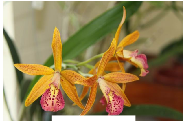
Blc. Rustic Spots