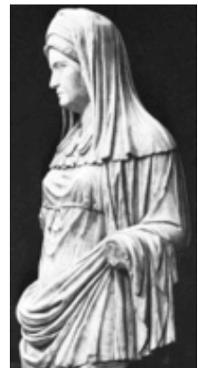
gin marble in the Museo Romano Rome.