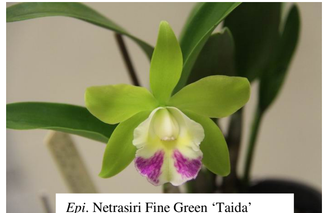
Epi. Netrasiri Fine Green 'Taida'